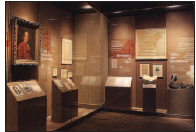
The history of our nation displayed.

The graph illustrates the blocking effectiveness of UF-96 as compared to other products, with the Percent Transmission axis signifying the light transmission of the acrylic at a given wavelength. Light below 400nm is considered to be ultraviolet. As you can see, almost all of the ultraviolet rays are blocked by UF-96, giving you the clearest, strongest guardian for your items.