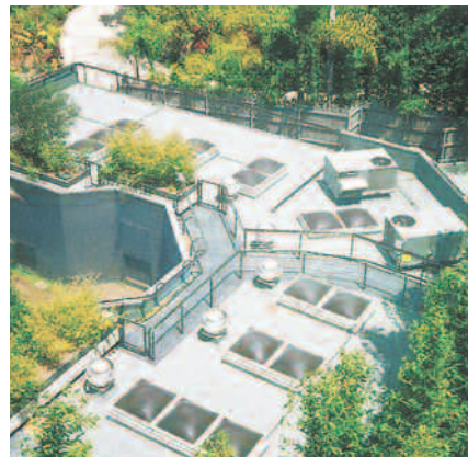
A typical skylight application at The San Diego Zoo.

• Delivery: Fast delivery is a hallmark of Polycast. Stocking locations are strategically located in California, Florida, Illinois, New Jersey and Texas.