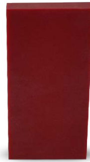
NV-104 RUBY RED