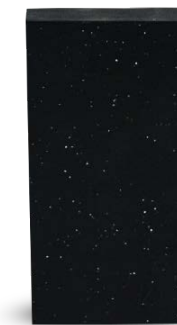
NV-402 SPARKLE BLACK