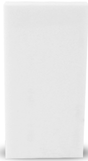
NV-099 ULTRA WHITE ICEBERG