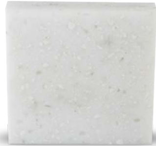
NV-305 SNOW WHITE