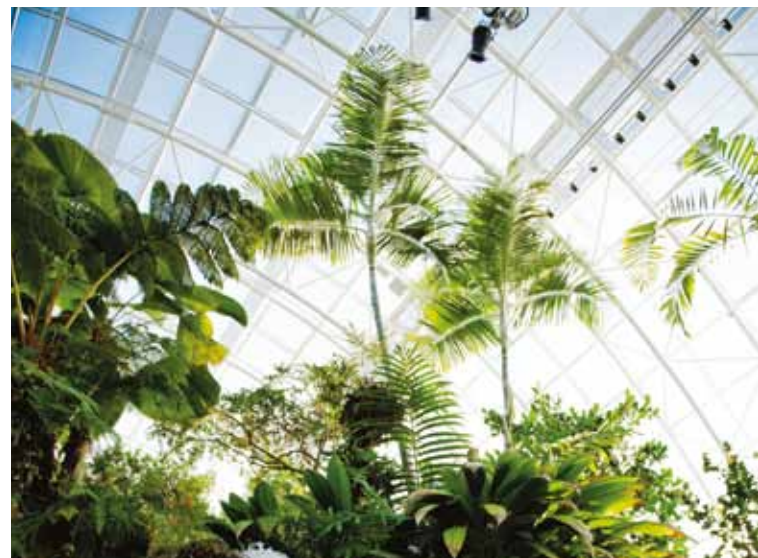
Cover: 16 mm ACRYLITE® Alltop UVT acrylic double-skin sheet and 16 mm ACRYLITE Resist high impact acrylic double-skin in clear, white and bronze are showcased on the exterior of the Philadelphia Zoo's McNeil Avian Centre. Architect: Portico Group. Left: Light transmitting 16 mm ACRYLITE® Resist high impact acrylic double-skin in light white installed on the exterior provides soft illumination to the neighbourhood. Architect: Sander Architects, LLC. Above Left: 8 mm ACRYLITE® Resist high impact acrylic double-skin sheet in manhattan satin is featured in Joe Fresh New York. Architect: Burdifilek. Above Right: Light floods through 16 mm ACRYLITE® Resist high impact acrylic double-skin sheet at Myriad Botanical Gardens, Oklahoma City. Architect: Glover Smith Bode Inc.