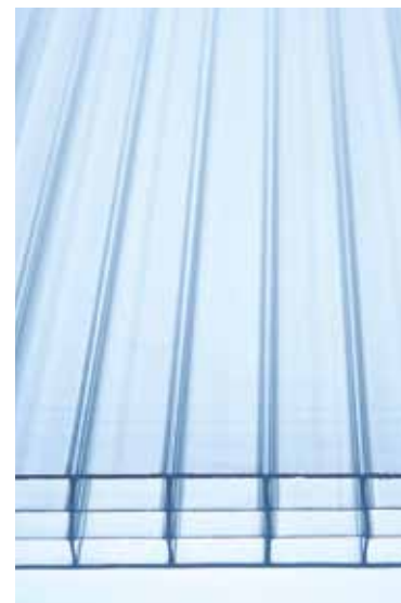
Left: Joe Fresh New York. 8 mm ACRYLITE® Resist high impact acrylic double-skin sheet in manhattan satin. Architect: Burdifikel. Above Left: 16 mm ACRYLITE® Resist high impact acrylic double-skin sheet. Above Centre: 3 mm ACRYLITE® Resist high impact acrylic wave profile. Above Right: 32 mm ACRYLITE® Resist high impact acrylic quad-skin sheet.