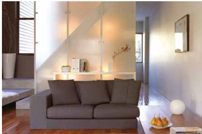
Left: Racine Art Museum. 16 mm ACRYLITE® Resist high impact acrylic double-skin in light white allows natural light into the Museum. Design: Brininstool+Lynch. Above Left: Timber construction and 16 mm ACRYLITE® Resist high impact acrylic double-skin in light white, are featured in this chalet-style roof. Design/Build: Natural Light Patio Covers. Above Right: Floor to ceiling 16 mm ACRYLITE® Resist high impact acrylic double-skin in light white, provide an unobtrusive safety barrier for an interior stairwell. Designer: Simmer Design + Project Management.