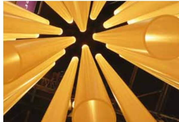
Left: ACRYLITE® acrylic tubes light up the Omni Dallas Hotel and the Dallas streetscape. Design Architect: 5Gstudio collaborative. Architect of Record: BOKA Powell. Above Left: ACRYLITE® acrylic rods offer superior light transmission. Above Centre: ACRYLITE® acrylic tubes and ACRYLITE® acrylic rods are 11 times stronger than glass and break resistant. Above Right: ACRYLITE® acrylic tubes are ideal for both indoor and outdoor lighting applications.