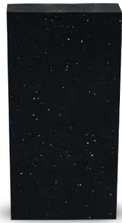
NV-402 SPARKLE BLACK