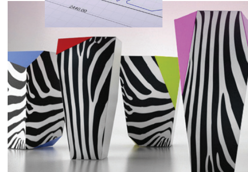
Ship flat. Assemble. Disassemble. Repeat.