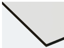
Metropolitan Manhattan Black