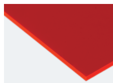
Fluorescent Mars Red