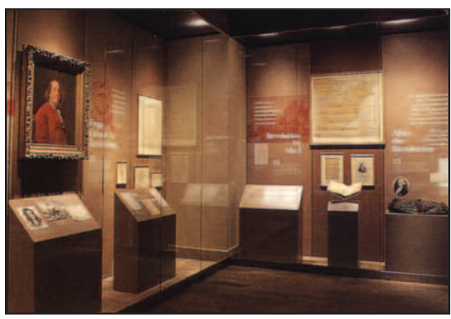
The history of our nation displayed.

The graph illustrates the blocking effectiveness of UF-96 as compared to other products, with the Percent Transmission axis signifying the light transmission of the acrylic at a given wavelength. Light below 400nm is considered to be ultraviolet. As you can see, almost all of the ultraviolet rays are blocked by UF-96, giving you the clearest, strongest guardian for your items.