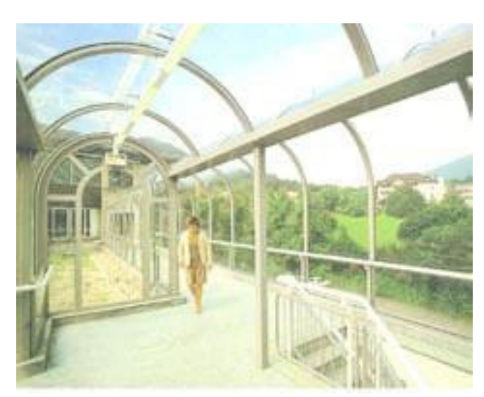
PolyOne Polycast® SARTM maintains clarity and beauty for years.